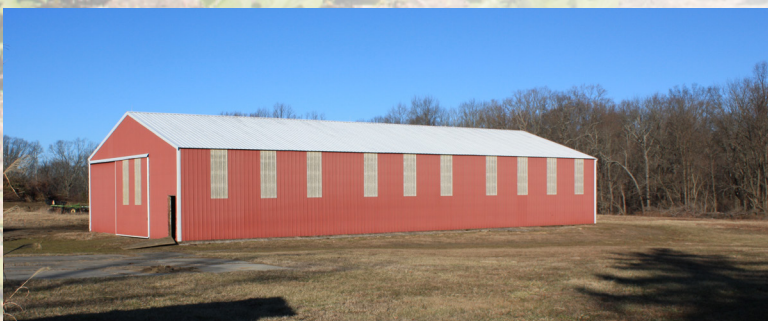
4.200 + sq ft Barn with 14' Doors

888-299-1438 MAXSPANN.COM SERVING THE NATION