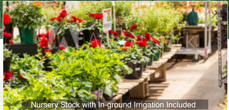
Nursery Stock with In-ground Irrigation Included

Auction: On-Site, Friday, April 3, 2020 at 1 PM 49 Holmes Mill Road Upper Freehold Township (Cream Ridge) Monmouth County, NJ 08514