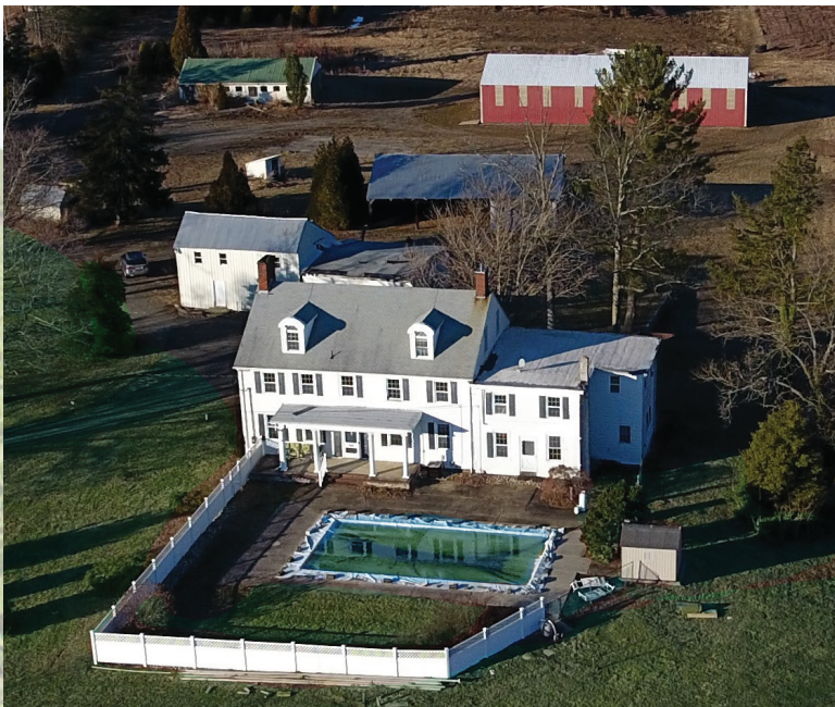
Pre-1800 Colonial Home with Six Bedrooms and Pool