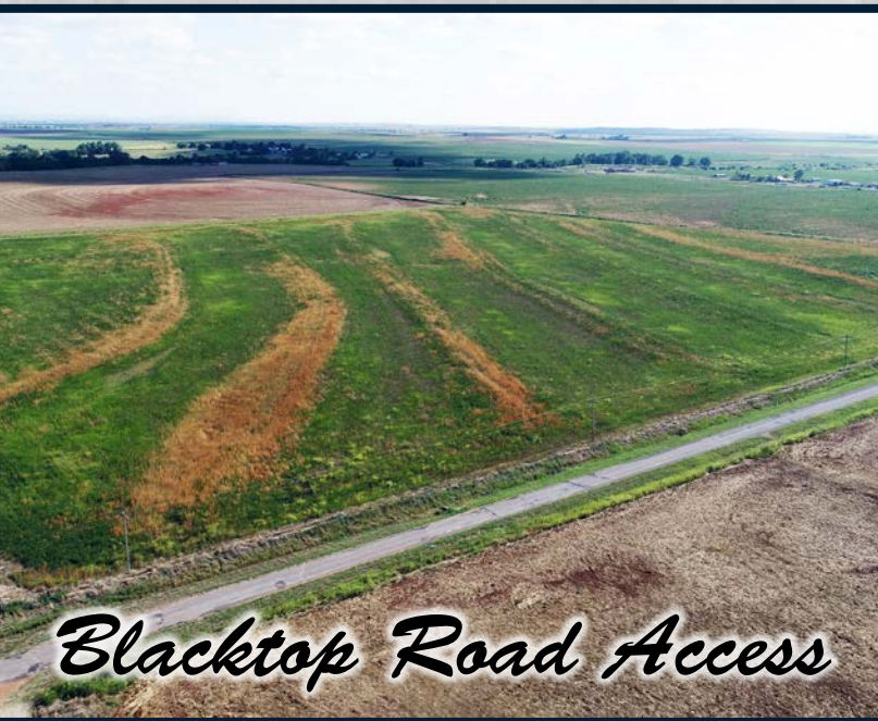
Blacktop Road Access