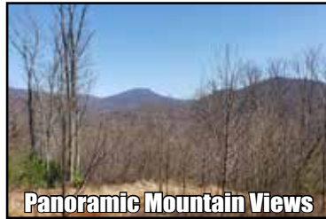
Panoramic Mountain Views