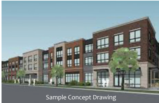
Sample Concept Drawing