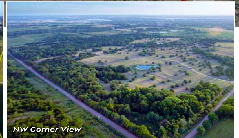
NW Corner View