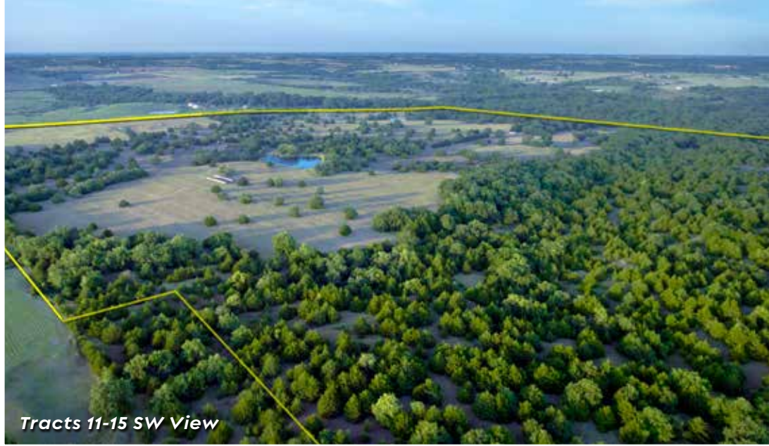
Tracts 11-15 SW View