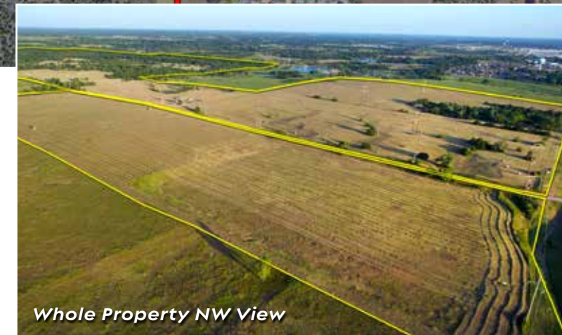
Whole Property NW View