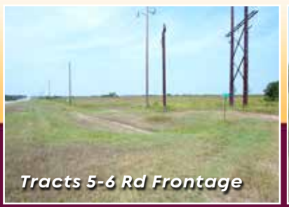
Tracts 5-6 Rd Frontage