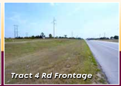
Tract 4 Rd Frontage