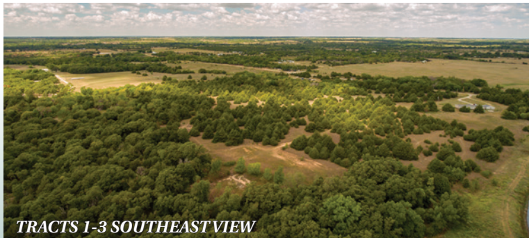
TRACTS 1-3 SOUTHEAST VIEW