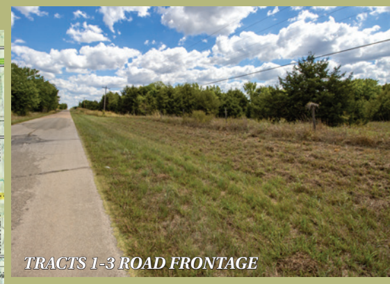
TRACTS 1-3 ROAD FRONTAGE