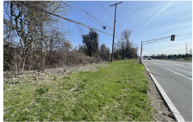
Frontage on Route 22