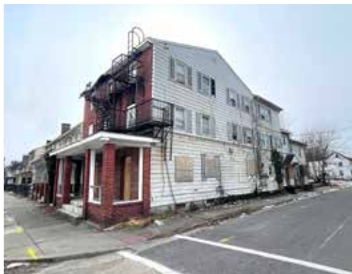
Residential Renovation 345 East Broadway