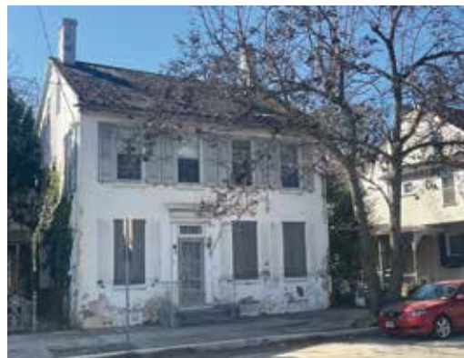
Steeped in History 57 Market Street

50+ PROPERTIES FOR REDEVELOPMENT INCLUDING STRUCTURES AND LOTS THROUGHOUT THE CITY