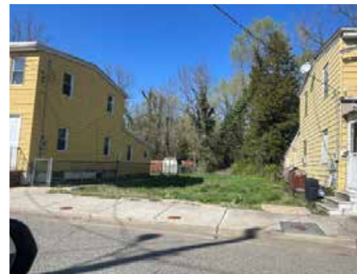
Two Residential Lots Sold Together 198 & 200 Pflieger Street