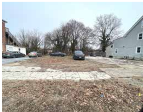
Downtown Commercial Zoned Lot 386-388 E Broadway